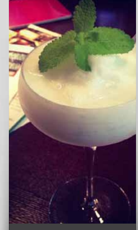
04 INTERACTIVE ACTIVITIES SUCH AS COCKTAIL CONTESTS AND FOOD PAIRING. - BAR GRATITUD, TOKYO. FROZEN COCKTAIL CONTEST -